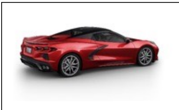
2025 Build Your Own Corvette or $85,000 10/24/2024 Price: $250.00 Tickets: 1500