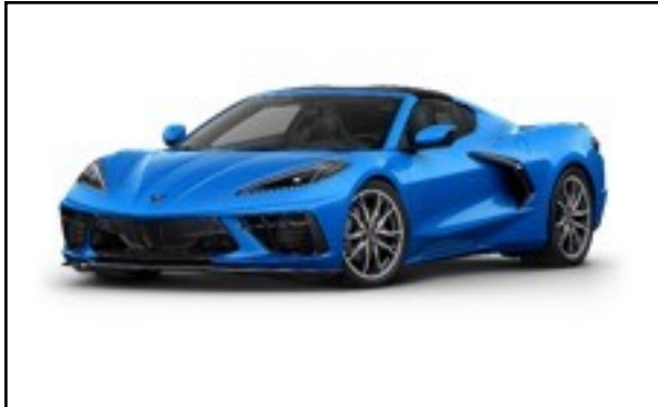
2024 Rapid Blue Corvette Coupe 9/19/2024 Price: $100.00 Tickets: 2000