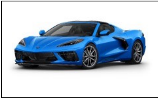
2024 Rapid Blue Corvette Coupe 9/19/2024 Price: $100.00 Tickets: 2000