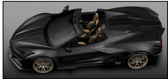
2024 Black Corvette Z06 Convertible 8/30/2024 Price: $350.00 Tickets: 1994

Why is this black Z06 raffle so pricey? That is because this will be a one-of-a-kind Z06. Earlier this month, GM Authority reported that the National Corvette Museum was raffling off a special 30 th Anniversary 2025 Corvette Z06. Now, NCM has released a comprehensive rundown on some of the goodies the high-performance 30 th Anniversary 2025 Corvette Z06 will feature.