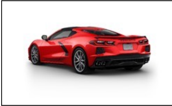
2024 Torch Red Corvette Coupe 8 /31/2024 Price: $20.00 Tickets: Unlimited