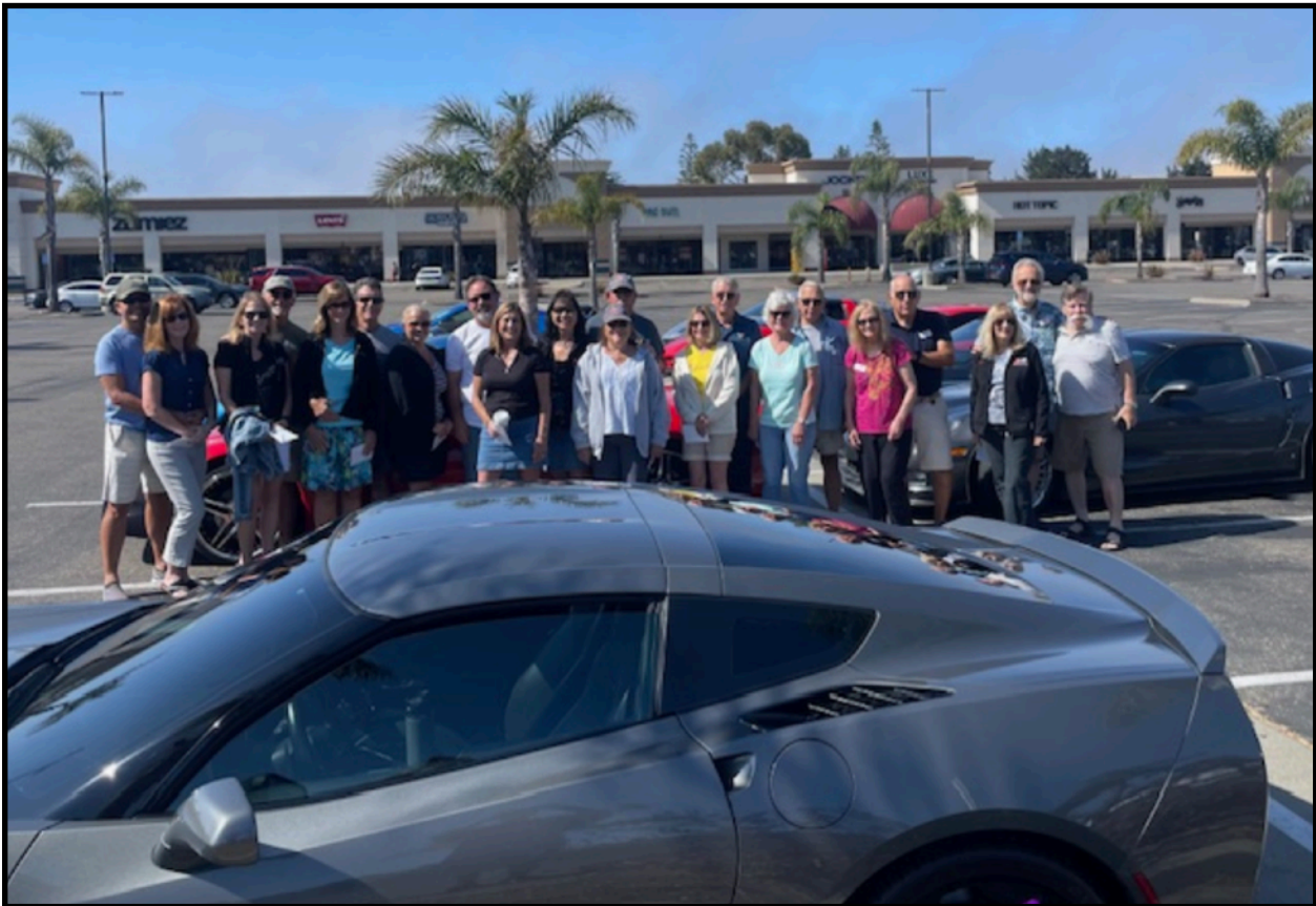
The Solvang Theaterfest Run Gang at Lunch in Solvang, on the Road, and at the Outlets Ready to Hit the Road.