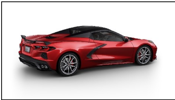
2024 Red Mist Corvette Convertible 8/8/2024 Price: $200.00 Tickets: 1500 Tickets

Below are all the currently active raffles. For additional information and rules regarding National Corvette Museum raffles including how to order tickets and to view the number of tickets remaining available in real time, go to https://raffle.corvettemuseum.org . The cars will be raffled off on time regardless if all the tickets are sold. I wish you the best of luck and hope to see photos of you picking up your prize at the Museum.