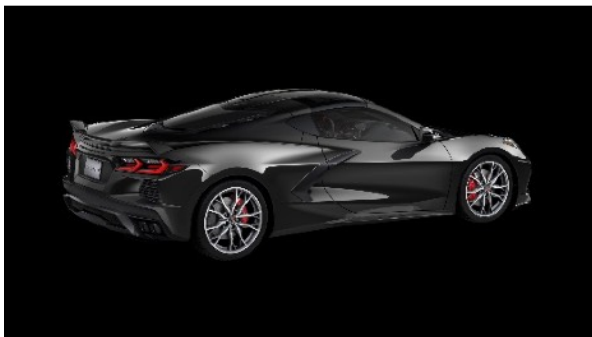
2024 Black Corvette Coupe 7/18/2024 Tickets are $150 Tickets 1500