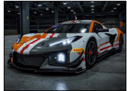
Steller Motorsports Entry for British GT3 Championship Series

Well, the racing season has come to an end so we can all sit back and contemplate what might happen next year, with the two best teams running the Corvette Z06 GT3.R, Pratt Miller Racing and DXDT, now mixing it up in the same series, the IMSA Weathertech Championship. TF Sport, which runs its two Corvettes in the World Endurance Championship (WEC) series will be joined at the 24-Hours of Le Mans by Team AWA's #13 Z06 GT3.R, which won the invitation by winning the Bob Akin Award in the IMSA series. Meanwhile, in England, the British Steller Motorsports team will be fielding two Z06 GT3.R's in the British GT3 Championship. Steller Motorsports won the GT4 Championship in 2022 and believes the new Corvettes will be fighting for the title in the 2025 GT3 series.