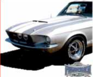
1967 SHELBY OWNED BY: JEFF FRANCIS